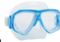
Clear Silicone / Light Blue Frame (FB)